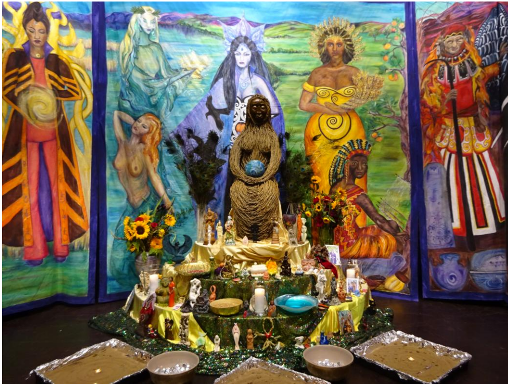
The head altar on the stage