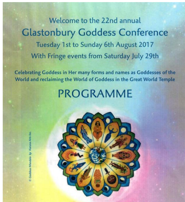
Cover page of the Programme of 40 colourfull pages. See website for full programme.