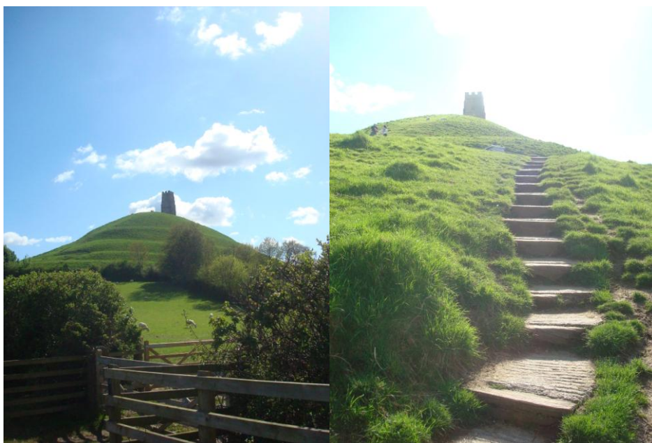
Climbing the Tor

Sunday 6 th Aug. 10.00am Goddess Procession through Glastonbury into the Sacred Landscape of Avalon.