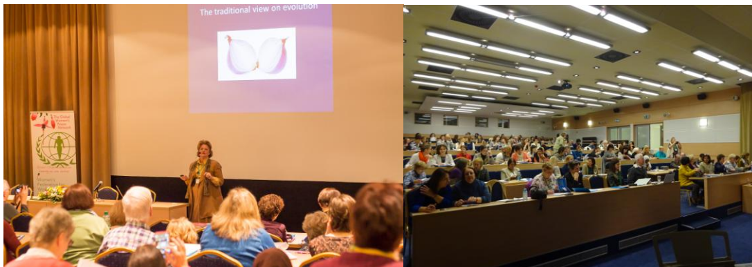
Lecture 'Wisdom returning' and audience on Friday-evening.