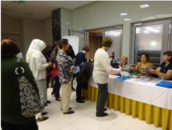
Registration on Friday evening