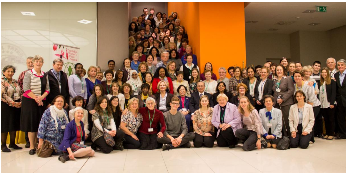
Sunday, group picture in the hall at the entrance of the conference room.